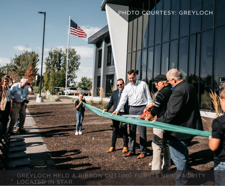
GREYLOCH HELD A RIBBON CUTTING FOR ITS NEW FACILITY LOCATED IN STAR.