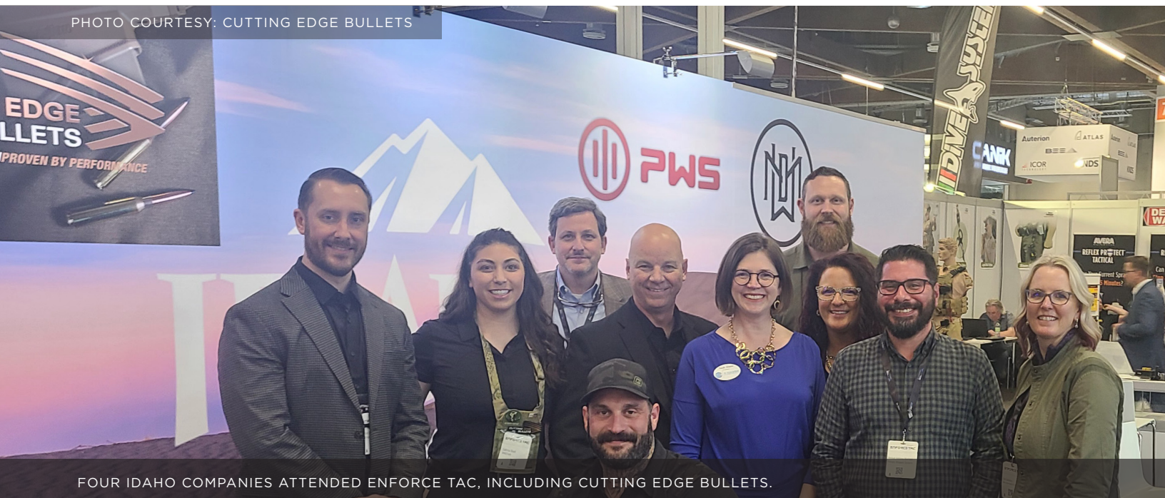
FOUR IDAHO COMPANIES ATTENDED ENFORCE TAC, INCLUDING CUTTING EDGE BULLETS.