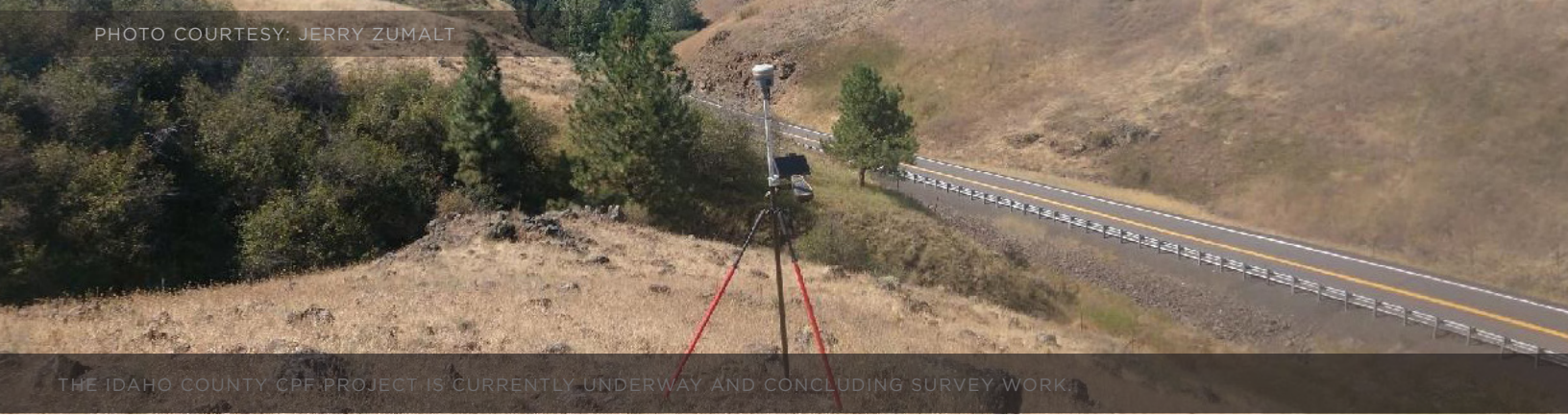
THE IDAHO COUNTY CPF PROJECT IS CURRENTLY UNDERWAY AND CONCLUDING SURVEY WORK.

create new opportunities for Idaho County including increased internet access for local government and anchor institutions, promoting increased economic activity, expanding employment opportunities and access to higher paying jobs.