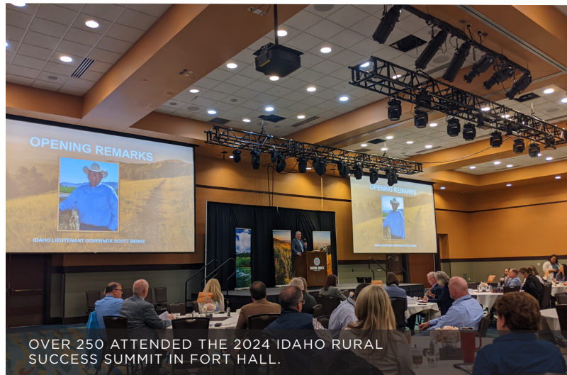
OVER 250 ATTENDED THE 2024 IDAHO RURAL SUCCESS SUMMIT IN FORT HALL.

“Rural communities often lack the specialized expertise found in larger urban areas,” Beseris said. “By fostering sustainable economic growth, the Rural ED Pro can help rural communities build a stronger foundation for the future. This includes supporting local businesses, promoting entrepreneurship and diversifying the economy.”