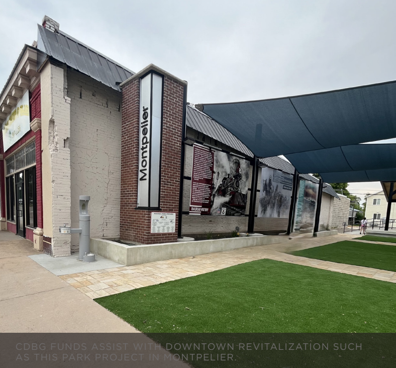
CDBG FUNDS ASSIST WITH DOWNTOWN REVITALIZATION SUCH AS THIS PARK PROJECT IN MONTPELIER.