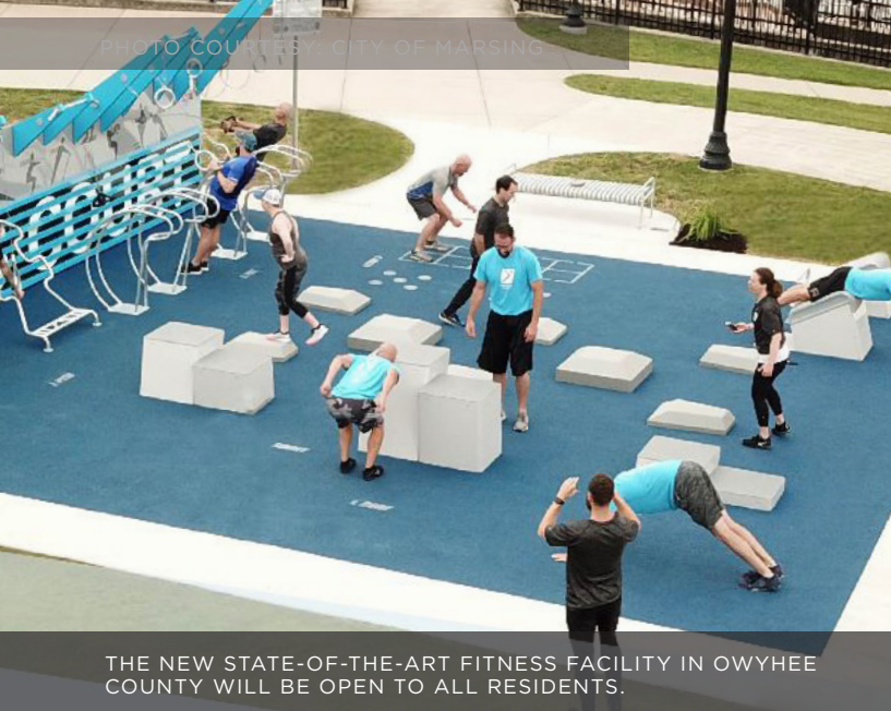
THE NEW STATE-OF-THE-ART FITNESS FACILITY IN OWYHEE COUNTY WILL BE OPEN TO ALL RESIDENTS.