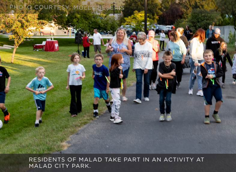
RESIDENTS OF MALAD TAKE PART IN AN ACTIVITY AT MALAD CITY PARK.