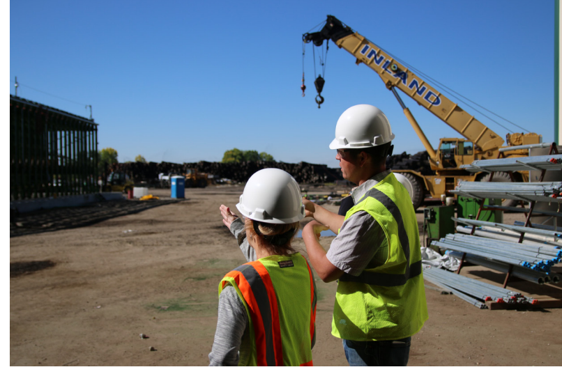
technology, natural resources, outdoor recreation, defense technology and more.

Industries of focus include advanced technology, innovation, entrepreneurial ventures, advanced energy, healthcare technologies, aerospace, agritech, food