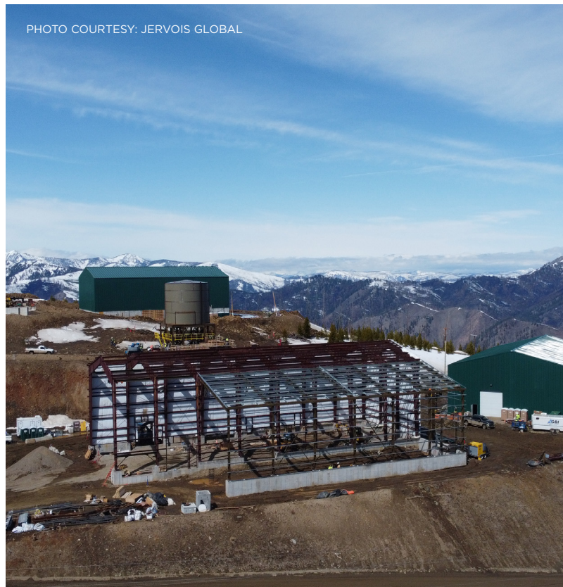
JERVOIS GLOBAL IS BRINGING A CAPITAL INVESTMENT OF OVER $140 MILLION AND OVER 160 NEW JOBS TO SALMON, IDAHO.