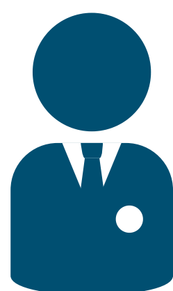
Professional, Scientific, Technical Services