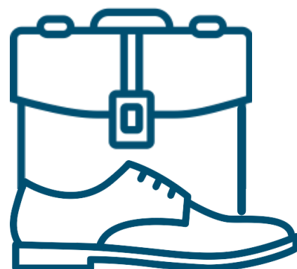
Leather and Allied Manufacturing